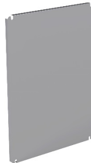
Kits for DIN rail